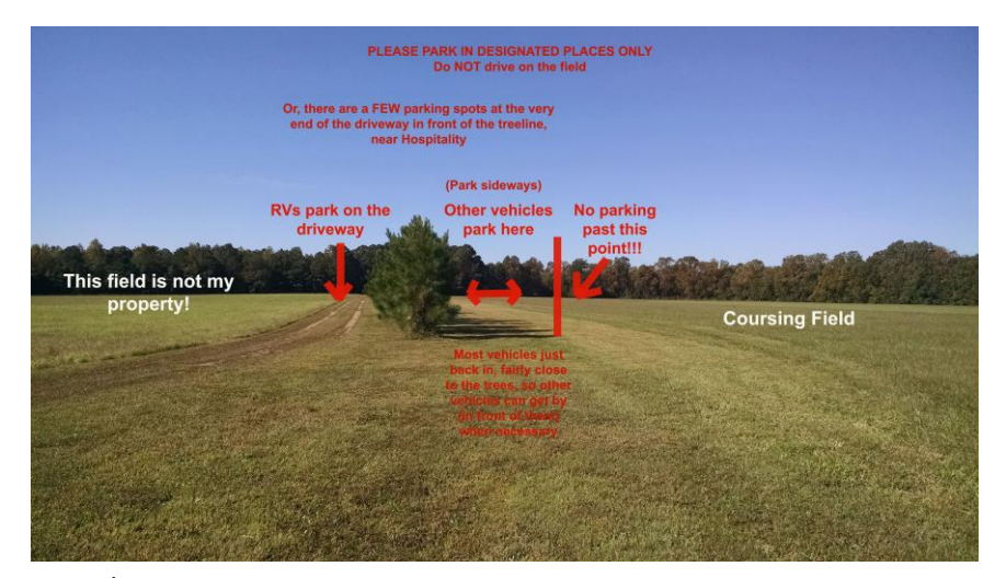
Please note the parking arrangement

EARLY ENTRIES CLOSE October 10, 2019, 6:00 pm at the FTS' address